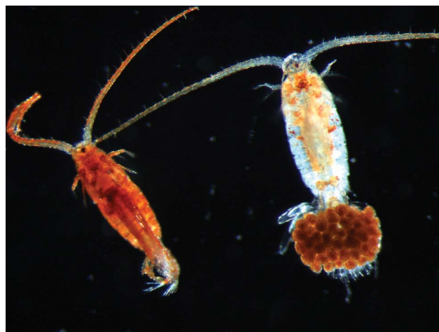
Fig. 3 Calanoid copepods are some of the most abundant multi-cellular animals on Earth. They are the dominant primary consumers in the world's oceans and in many lakes. These small crustacean zooplankton influence water quality and are a critical component of aquatic food webs that may influence survival and recruitment of commercially important fish. Shown here are an adult male (left) and a female freshwater calanoid with eggs (right). Note the brighter colour of the male and the eggs vs. the female due to higher concentrations of UV-protective compounds.

environmental stressors, including nutrient and food availability, as well as temperature, may pose a greater threat than UV radiation alone. 160 Zooplankton can detect and behaviourally avoid UV radiation in their daily vertical migration in more transparent lakes and oceans. 161 While differences in tolerance to UV among species do not necessarily lead to changes in community structure of zooplankton, 162 limitations of nutrients, availability of food, and cooler temperatures may all reduce tolerance to UV in zooplankton and larvae of invertebrates. 163–167 UV has a negative effect on calanoid copepods grazing at cooler temperatures. 168 Calanoid copepods are small crustaceans that are some of the most abundant metazoans on Earth (Fig. 3). Increased oxidative damage and developmental abnormalities of sea urchin embryos that were observed in field exposures in areas of high natural UV radiation in ozone-depleted regions may be aggravated by the loss of sea ice. 169 Recent modelling efforts targeting management strategies for penguins and seals indicate that the increase in UV-B radiation due to ozone thinning over Antarctica may have increased the mortality rate of Antarctic krill by as much as 10%. 170 Krill are a primary food source for these marine vertebrates.