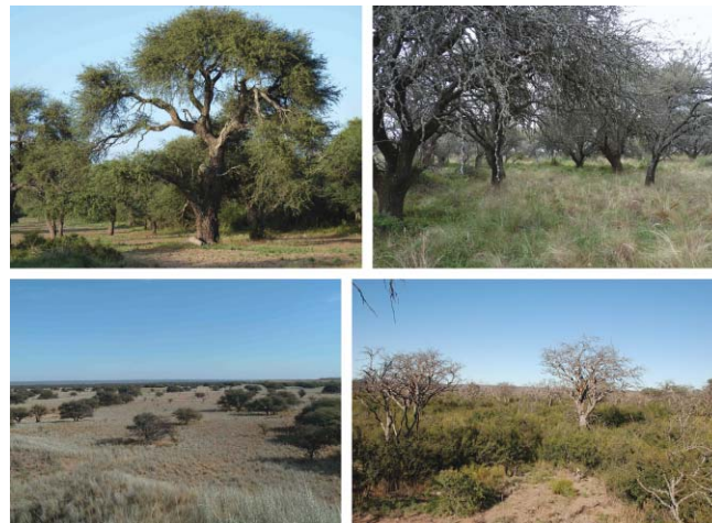
Figure 4. Rangelands of the Caldenal region of central Argentina. Open P. caldenia woodland with understory dominated by palatable fine grasses (upper left) or unpalatable bunchgrasses (upper right). Calden invasion of a degraded dune grassland (lower left) and fire-maintained shrub thicket structure (lower right).

The Caldenal occurs in valleys with loamy, well-developed soils and with a thin petrocalcic layer at variable depths from few centimeters to more than 1.5 m. Tallest trees are found in well-developed soils in the northern and central part of the region, while in less developed soils with lower precipitation, other woody species become important (e.g., Prosopis flexuosa , Condalia microphylla , Geoffroea decorticans ,