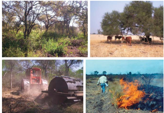
Figure 2. Chaco rangelands. Shrub invaded fachinal (upper left), open savanna (upper right), roller chopper treatment (bottom left), prescribed burn (bottom right).