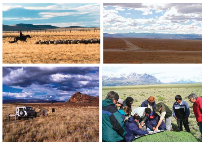
Figure 5. Rangelands of Patagonia. Sheep herding on the fescue grass steppes of southern Patagonia at INTA's Potrok Aike Experimental Range (upper left), dwarf shrub steppes of the plateaus of southcentral Patagonia (upper right), mesic fescue grass steppes surrounding the Straits of Magellan (bottom left), a group of rangeland specialists conducting rangeland survey training on rangelands of the Andes foothills (bottom right).

Patagonia includes almost half of Argentina's arid and semi-arid shrublands and grasslands (780,000 km 2 ), which exhibit a relatively high rate of endemism and biodiversity. Most of the region is classified as a cold semi-desert with mean annual temperatures that rarely exceed 10°C and rainfall levels ranging from 150 to 250 mm/year. Patagonia's landscapes span more than 13° in latitude and exhibit altitudes