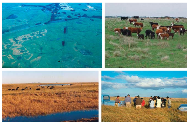
Figure 3. Aerial view of flooding Pampa rangelands located between Balcarce and Coronel Vidal showing plant community heterogeneity associated with topography in a wet year (upper left), late spring cow-calf grazing of rangelands dominated by Paspalum quadrifarium tussocks (upper right), winter cow-calf grazing of flooding Pampa rangelands (bottom left), late summer field day with ranchers on a dallisgrass ( Paspalum dilatatum ) dominated rangeland after a period of extended floods (bottom right).

Traditional year-round continuous grazing has led to a reduction in cool season grasses, an increase in weeds and