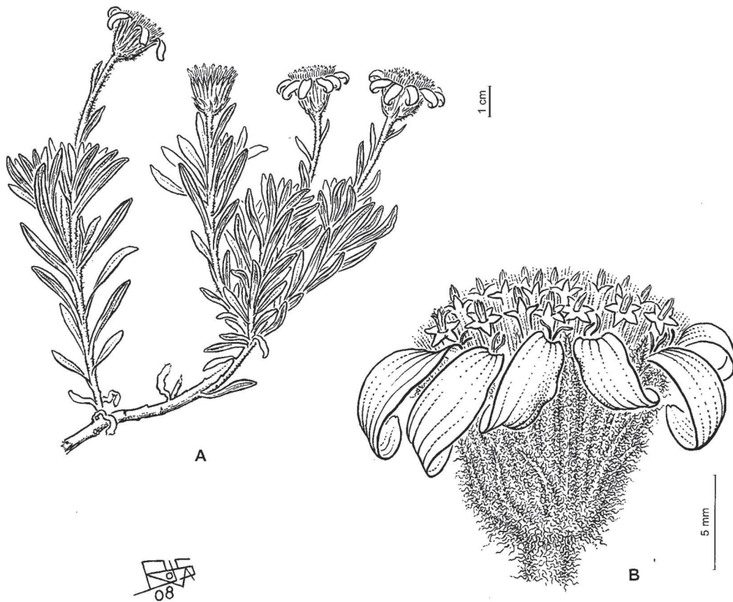
Figure 2. Senecio volckmannii Phil. var. pinohachense Tortosa & Adr. Bartoli. —A. Fertile habit. —B. Capitulum. Drawn from the holotype Nicora 7435 (BAA).

the boundary between Argentina and Chile at an elevation of 2018 m. The paratype comes from a mountain chain that extends to 1523 m, located in western Neuquén Province, Argentina.